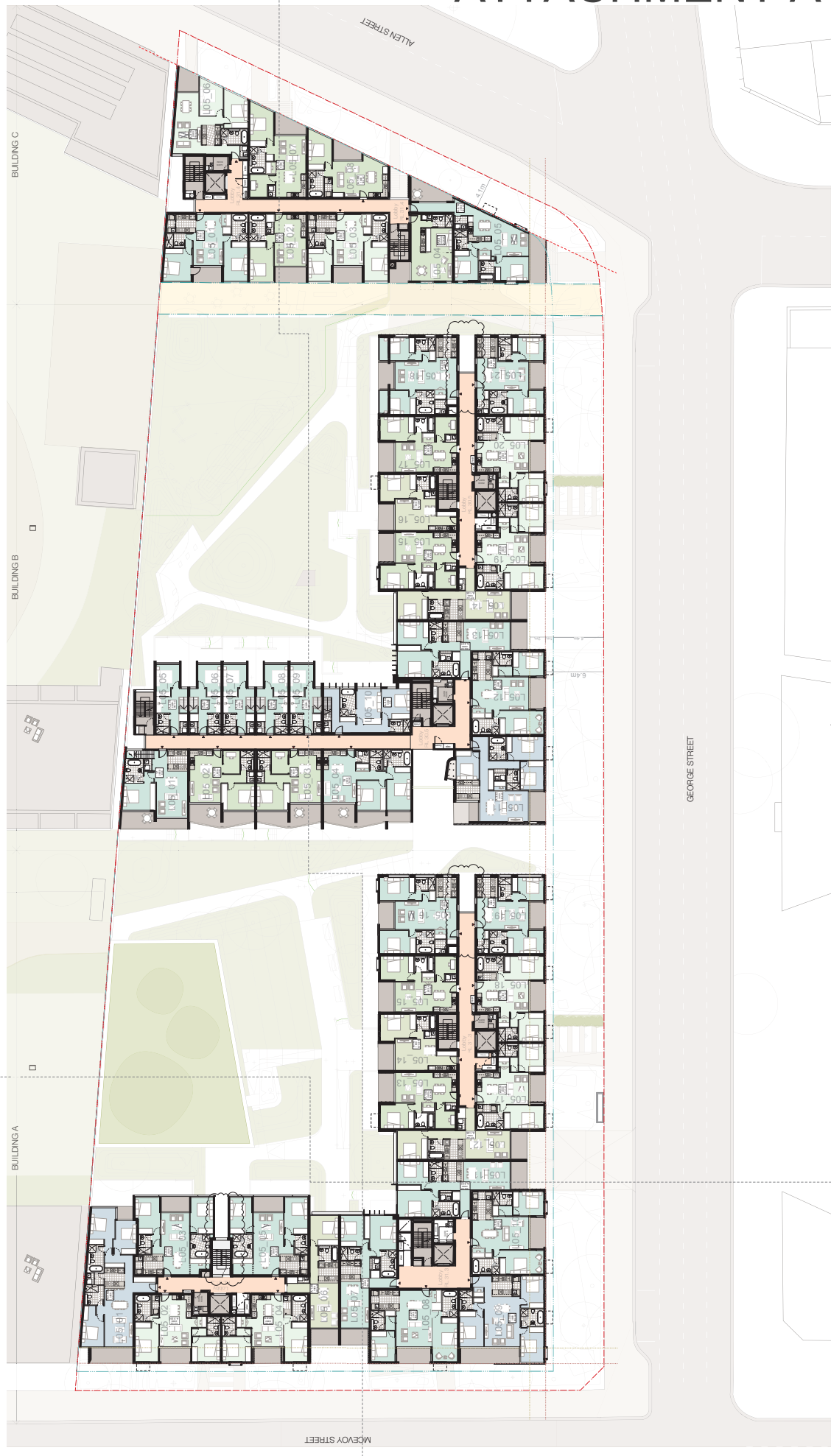
01 PLAN - LEVEL 05 1:250 @ A1