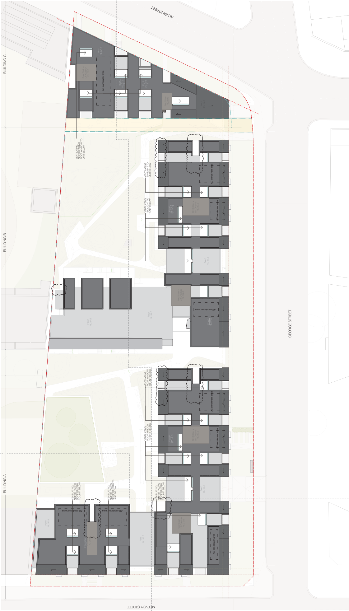
01 PLAN - LEVEL 07 (ROOF) 1:250 @ A1