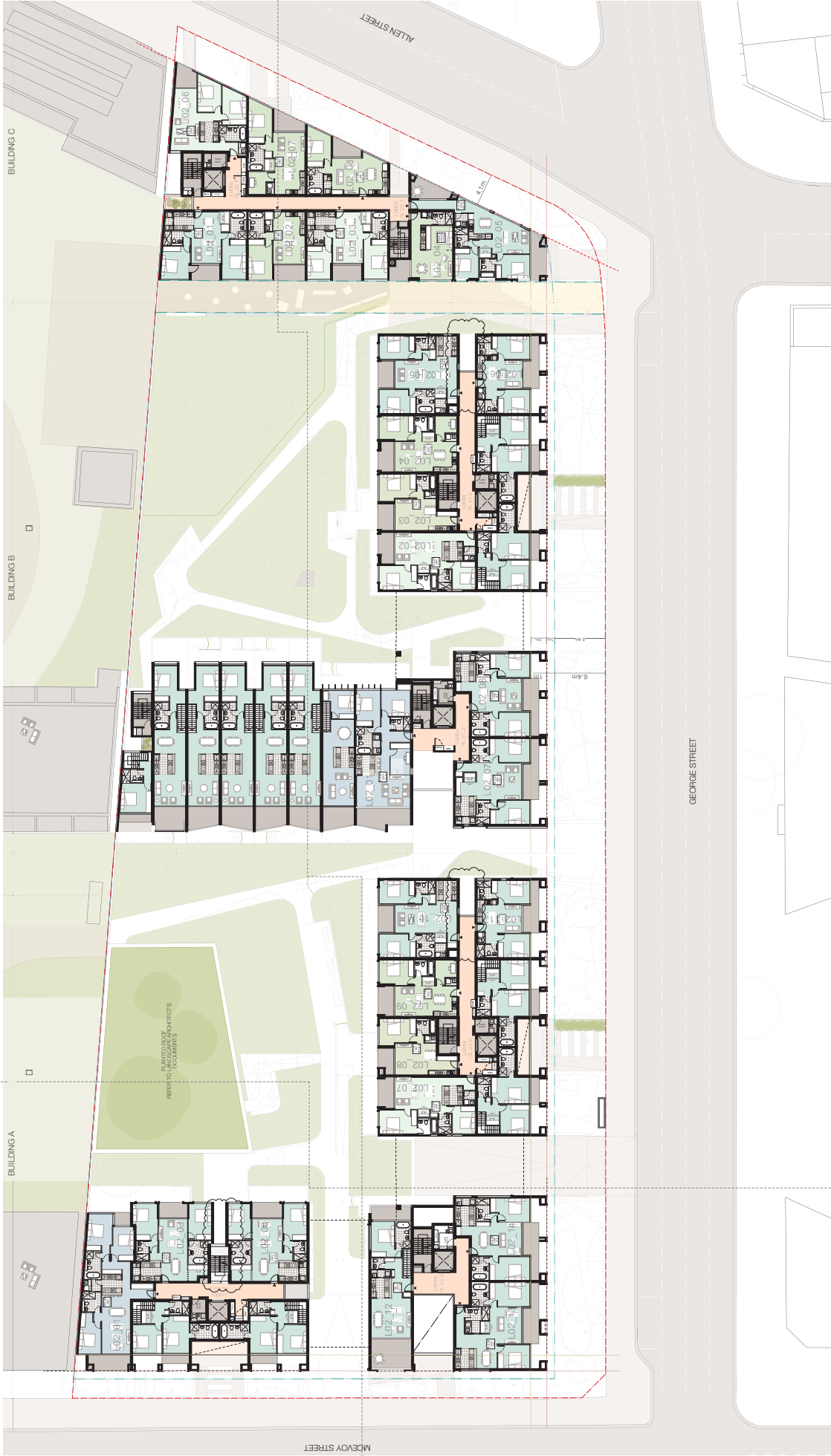
01 PLAN - LEVEL 02 1:250 @ A1